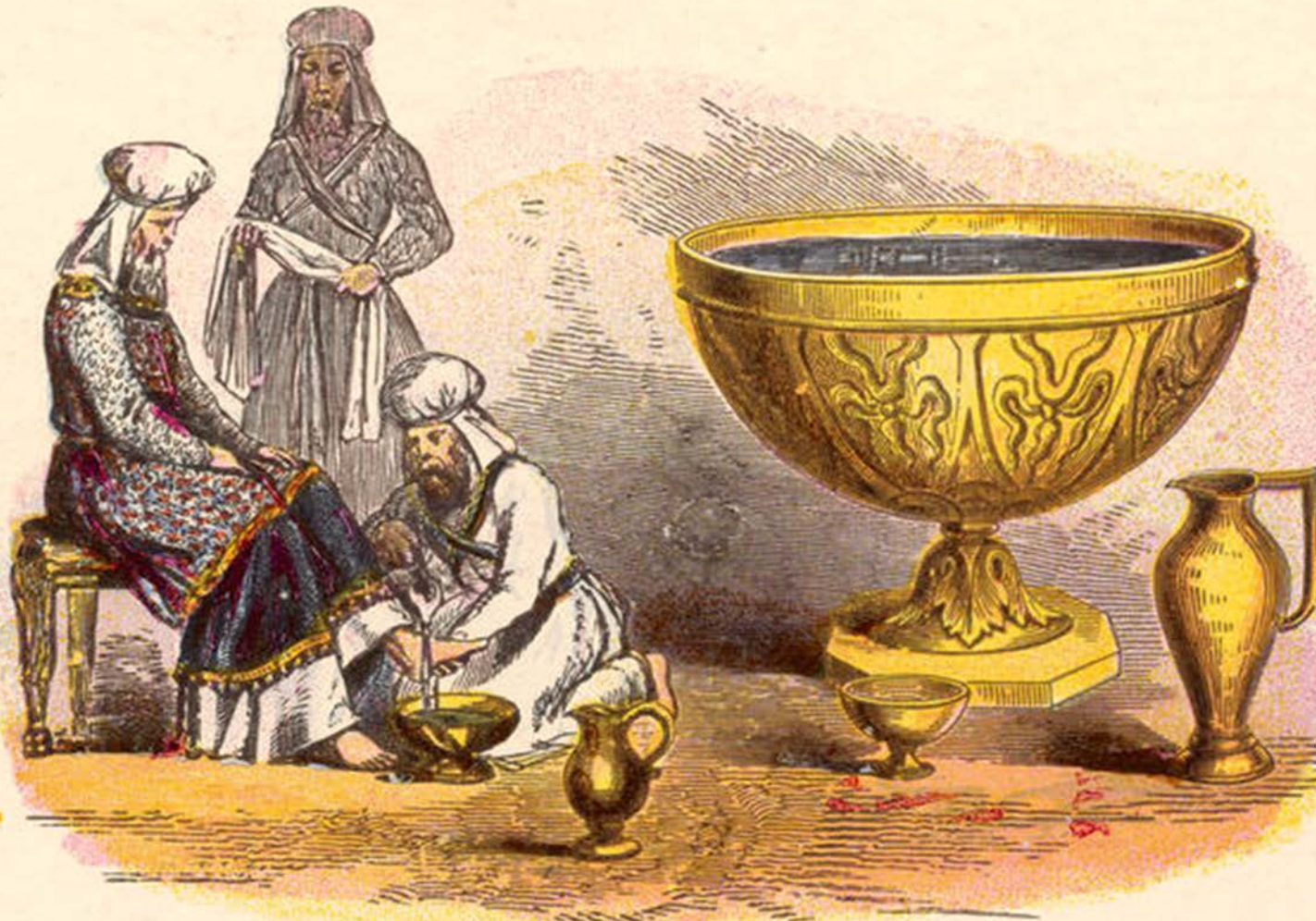
THE BRAZEN LAVER.

About the “sea of glass”, this is a technical term borrowed from the Old Testament use of the word for the “laver” in the ancient Jewish temple. And here the heavenly reality appears, of which the ancient Jewish “laver” was a mere symbol. The word “laver” means a bath or wash basin containing water for the purpose of washing. The Jewish priests were commanded to continually wash their hands and feet during tabernacle service.( Ex 30:17-21) Just as for the ancient Jewish priests, so in this heavenly vision, the overcomers, the saved and those washed by the water of the Word, are seen as standing over this sea, this “laver”, singing, praising and serving God.