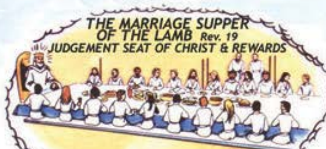
THE MARRIAGE SUPPER OF THE LAMB Rev. 19 JUDGEMENT SEAT OF CHRIST & REWARDS

FIRST GREAT MOUNTAIN CAST INTO SEA 3RD OF WATERS TURN TO BLOOD 3RD OF TREES DESTROYED Rev. 8:8-9 SECOND HALT & FIRE WITH BLOOD, 3RD OF GRASS BURNED Rev. 8:7 THIRD 3RD PART OF SUN, MOON & STARS DARKENED Rev. 8:12 FORTH STAR FALLS FROM HEAVEN 3RD OF WATERS TURN TO WORMWOOD, MANY DIE Rev. 8:10, 11 FIFTH LOCUSTS FROM THE BOTTOMLESS PIT TORTURE THE UNBELIEVERS FOR FIVE MONTHS Rev. 9:1-12 SIXTH 200 MILLION HORSEMEN KILL 3RD OF MANKIND Rev. 9:13-21 SEVENTH JESUS RETURNS Rev. 11:15-19 MIL. 24:29-31