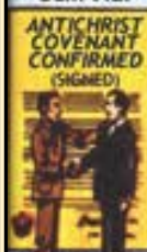
ANTICHRIST COVENANT CONFIRMED (SIGNED)

144,000 SAINTS (CHRISTIANS) SEALED FOR TRIBULATION. SPECIAL SPIRITUAL ISRAEL. JEWISH TEMPLE SACRIFICE BEGINS Rev. 7 Dan. 8:13, 14