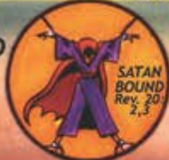
SATAN BOUND Rev. 20:2, 3