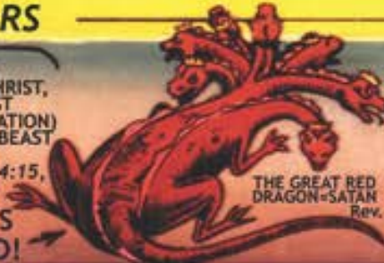
THE GREAT RED DRAGON-SATAN Rev. 12:9