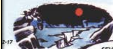
SIXTH SEAL WRATH OF GOD -THE END!

THE RESURRECTION & THE RAPTURE of the Saints!